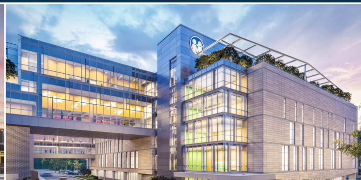
East Tennessee Children's Hospital Scripps Networks Tower Expansion